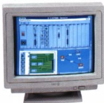
RADview - HPOV Network Management System